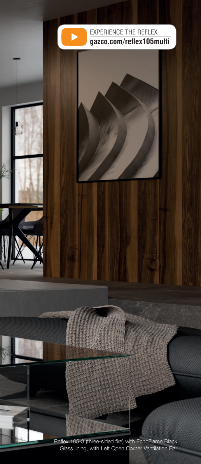
Reflex 105-3 (three-sided fire) with EchoFlame Black Glass lining, with Left Open Corner Ventilation Bar

EXPERIENCE THE REFLEX gazco.com/reflex105multi