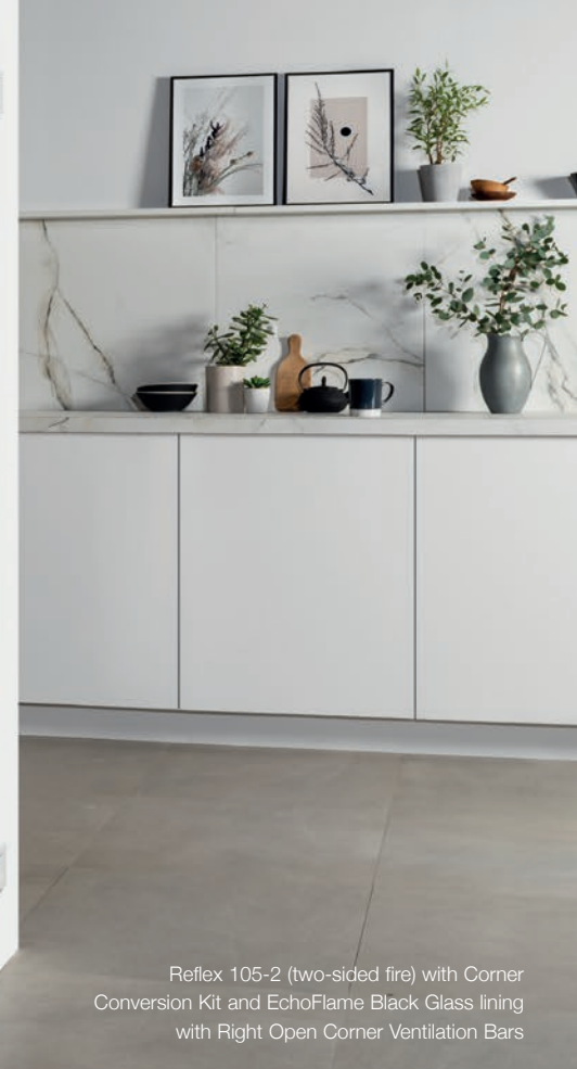
Reflex 105-2 (two-sided fire) with Corner Conversion Kit and EchoFlame Black Glass lining with Right Open Corner Ventilation Bars

EXPERIENCE THE REFLEX gazco.com/reflex105multi